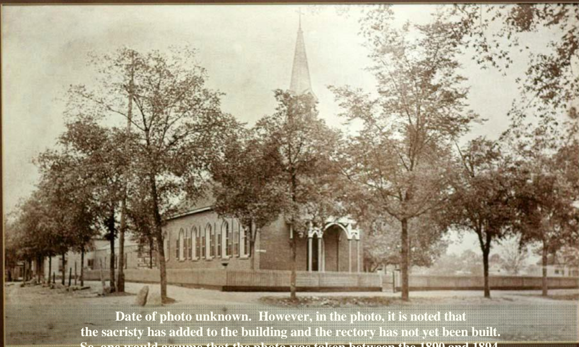
Date of photo unknown. However, in the photo, it is noted that the sacristy has added to the building and the rectory has not yet been built. So, one would assume that the photo was taken between the 1890 and 1894.