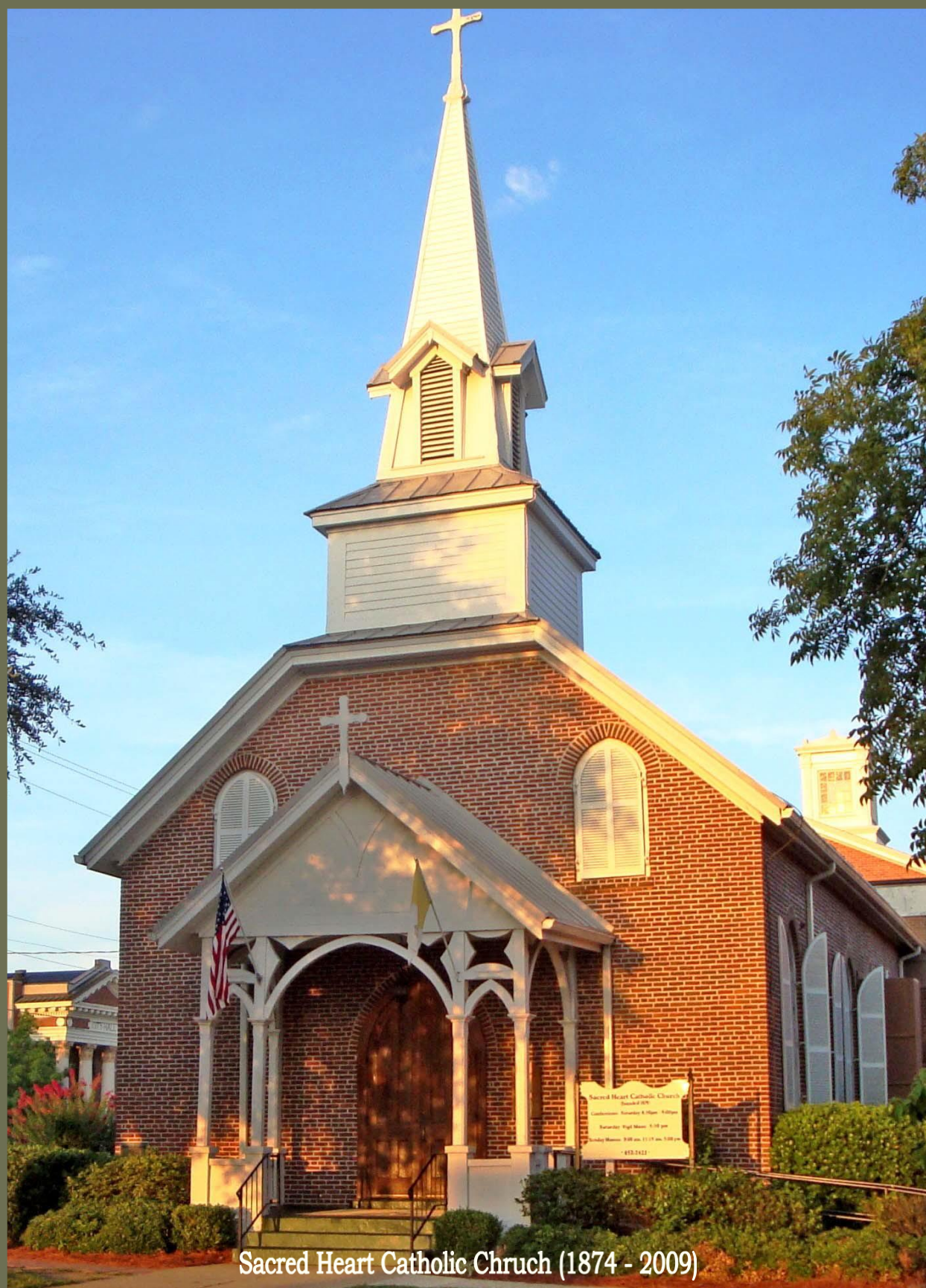
Sacred Heart Catholic Chruch (1874 - 2009)