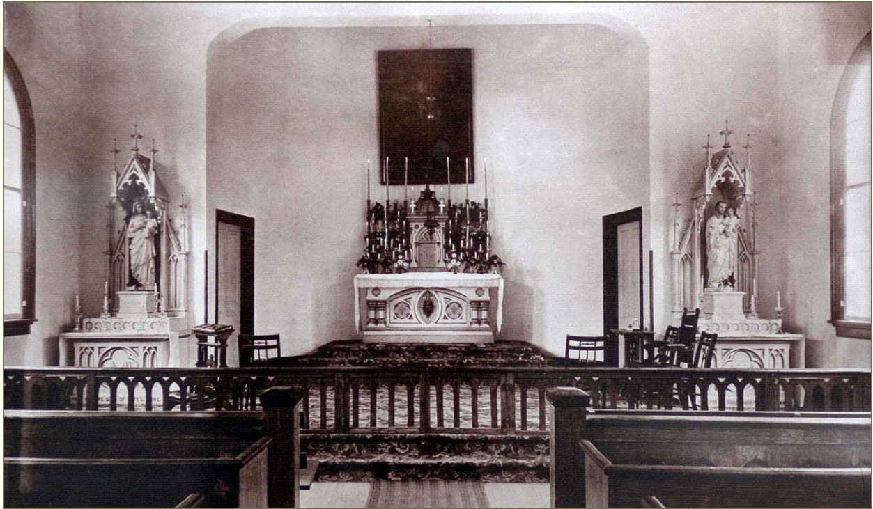
Photo presumed to have been taken prior to 1932 due to the absence of the Crucifix.