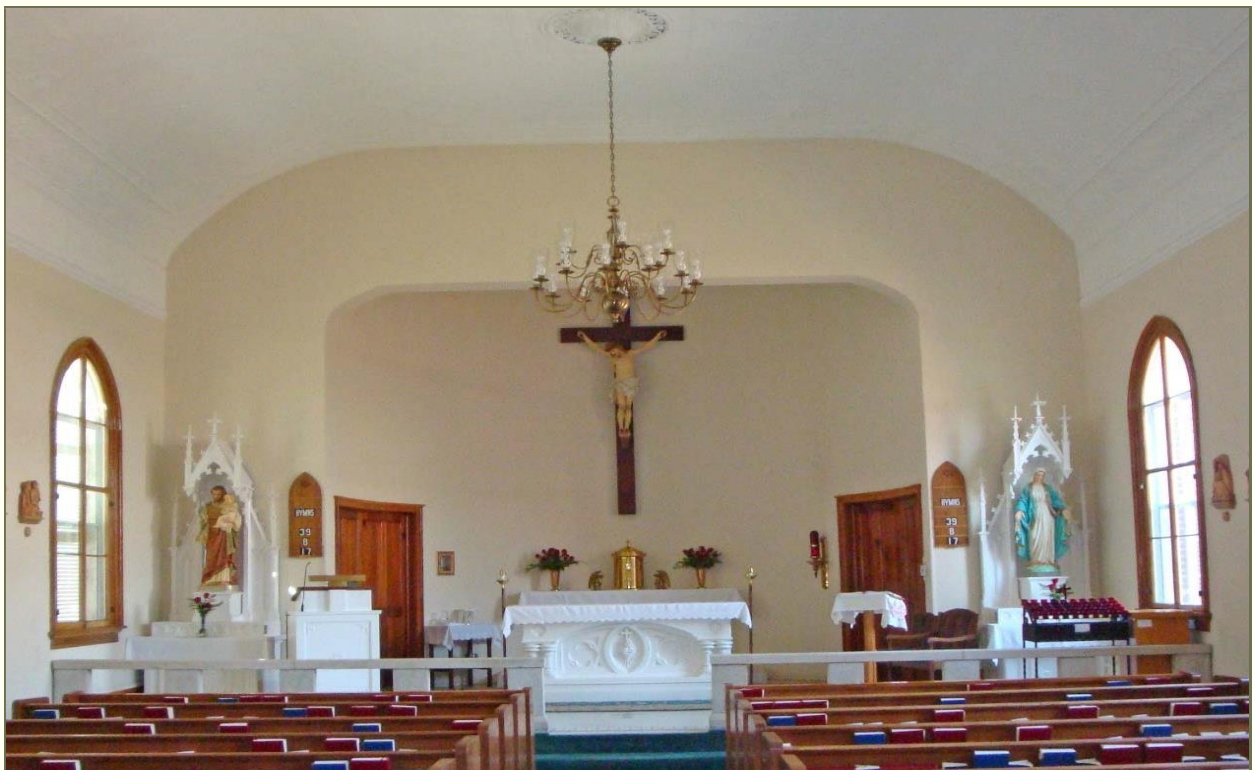
Same view as above taken September 2009